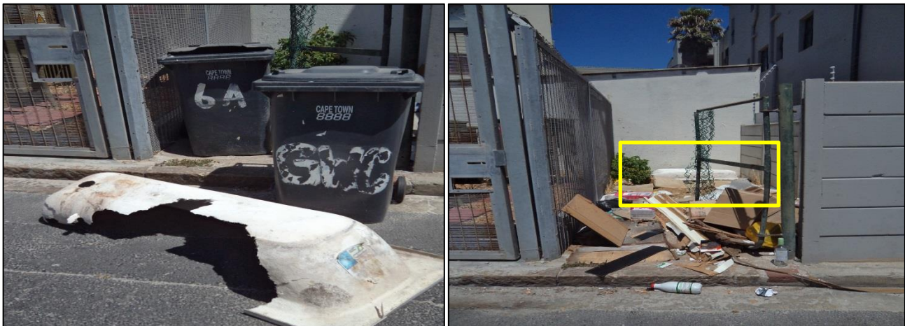
Figure 4: Dumping area next to electricity transformer on Church Road.