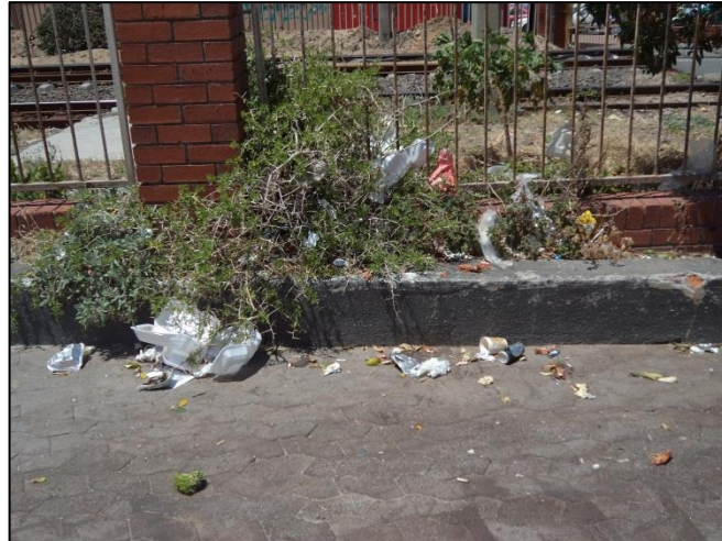
Figure 3: Waste left behind on site after refuse collection.