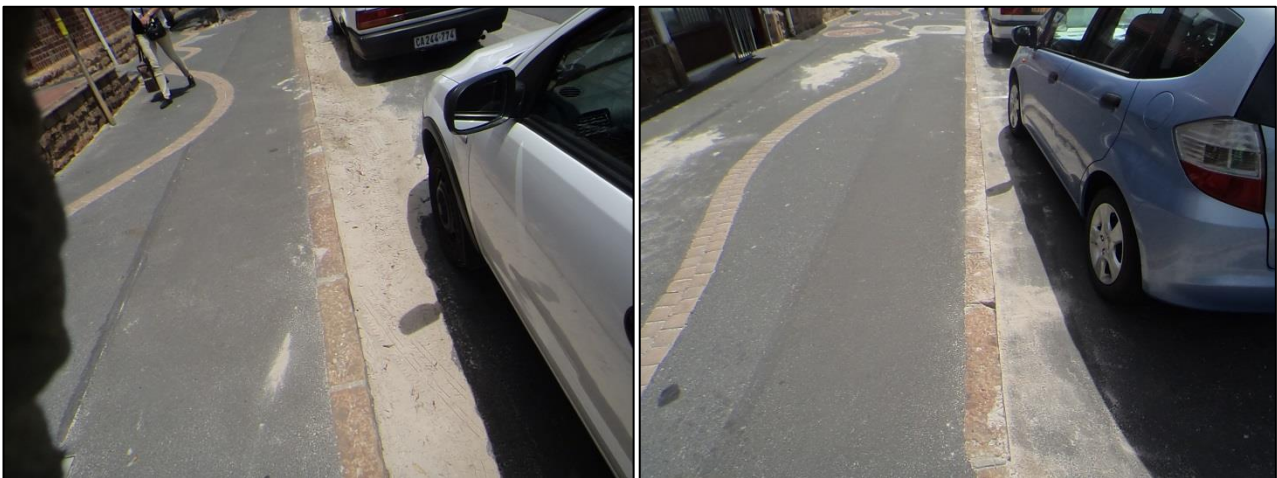
Figure 2: Sand Build-up and maintenance on Beach Road.

The team made a concerted effort to monitor the cleanliness of the area during this month. Due to an ever present South Easterly wind blowing through the area, sand build-up is being monitored by the team. Sand build up in this area is a challenge, 2500 bags of sand was removed from Atlantic Road, Beach Road and Surfers Corner parking area. Clearing the sand from this area has an impact on the daily operational plan. Vagrants living on Atlantic Road are also contributing to the high volume of waste found in the area.