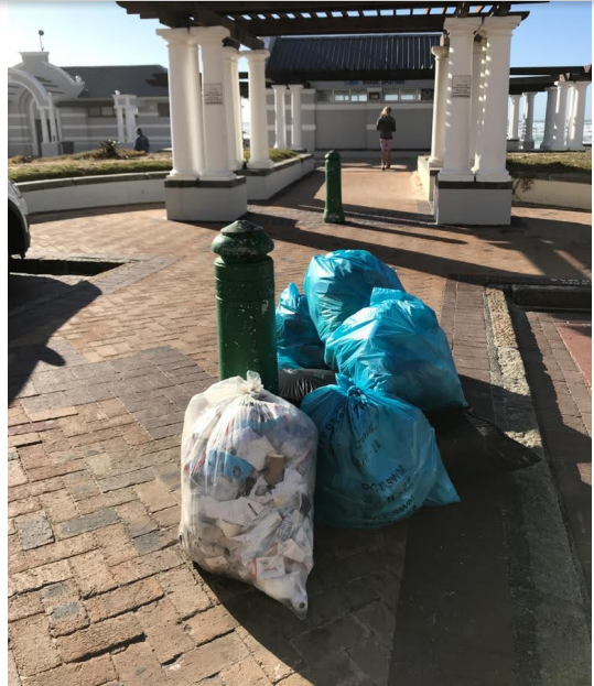
CAN volunteers cleaning the streets and beachfront cleaning

We again ask residents not to dump rubbish next to any bins but to make sure it is all placed in the bins. If there is overflow, residents need to make a plan with Council or MID. Let's all work together to foster a new attitude to cleaning and pick up whatever litter we see. We can't leave it all to a few employees.