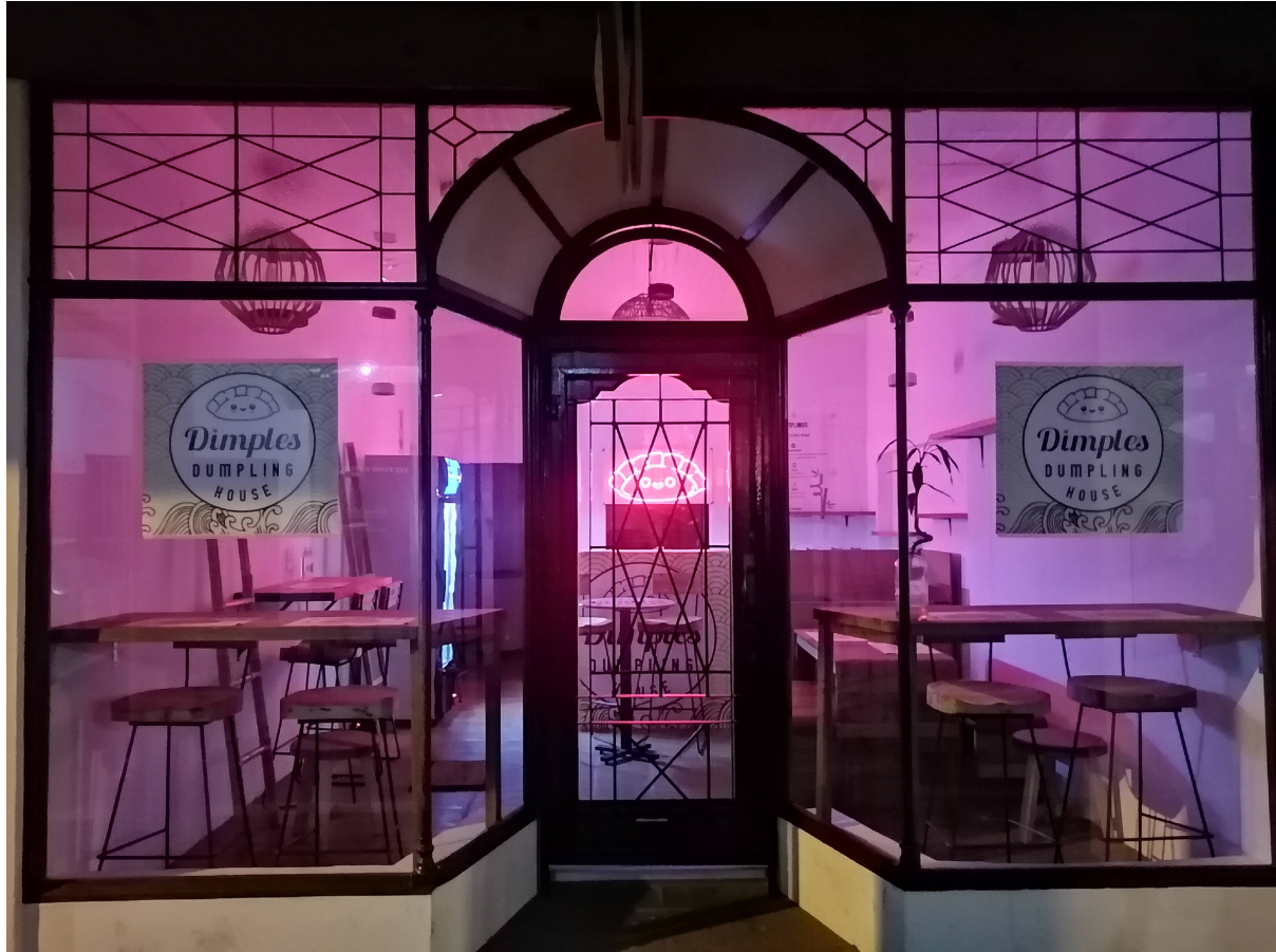
Dimples Dumpling House, Muizenberg's newest restaurant.

On the downside, we head into the festive season with the 'Second Wave' upon us.