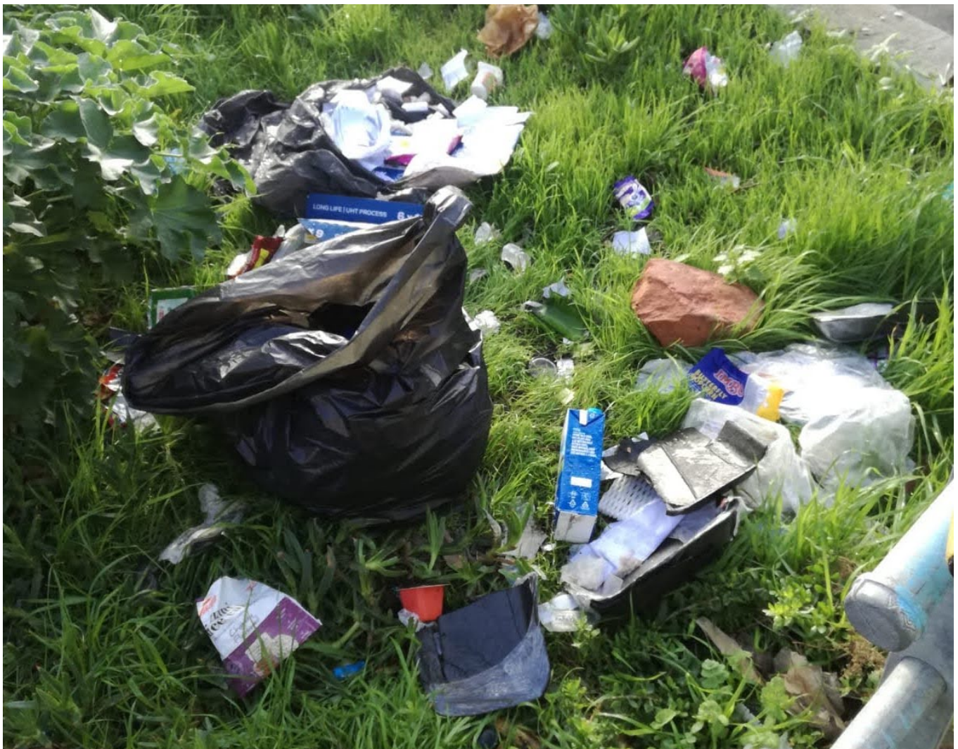
Dumping is a huge issue in the MID area, as pictured above.

In addition, the cleaning team have continued doing deep cleans as well as daily sweeping, and the roads are generally looking good. However, there is still a problem with illegal dumping, including large amounts of garden refuse being put on bin day, which is not picked up by council. Please arrange removal of your garden waste and other goods not collected by council.