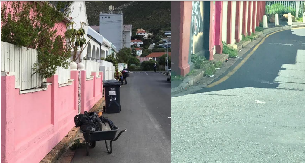
MID cleaners on a weeding mission. And always more weeds to be pulled.

In addition, the cleaning team have continued doing deep cleans as well as daily sweeping, and the roads are generally looking good. However, there is still a problem with illegal dumping, including large amounts of garden refuse being put on bin day, which is not picked up by council. Please arrange removal of your garden waste and other goods not collected by council.