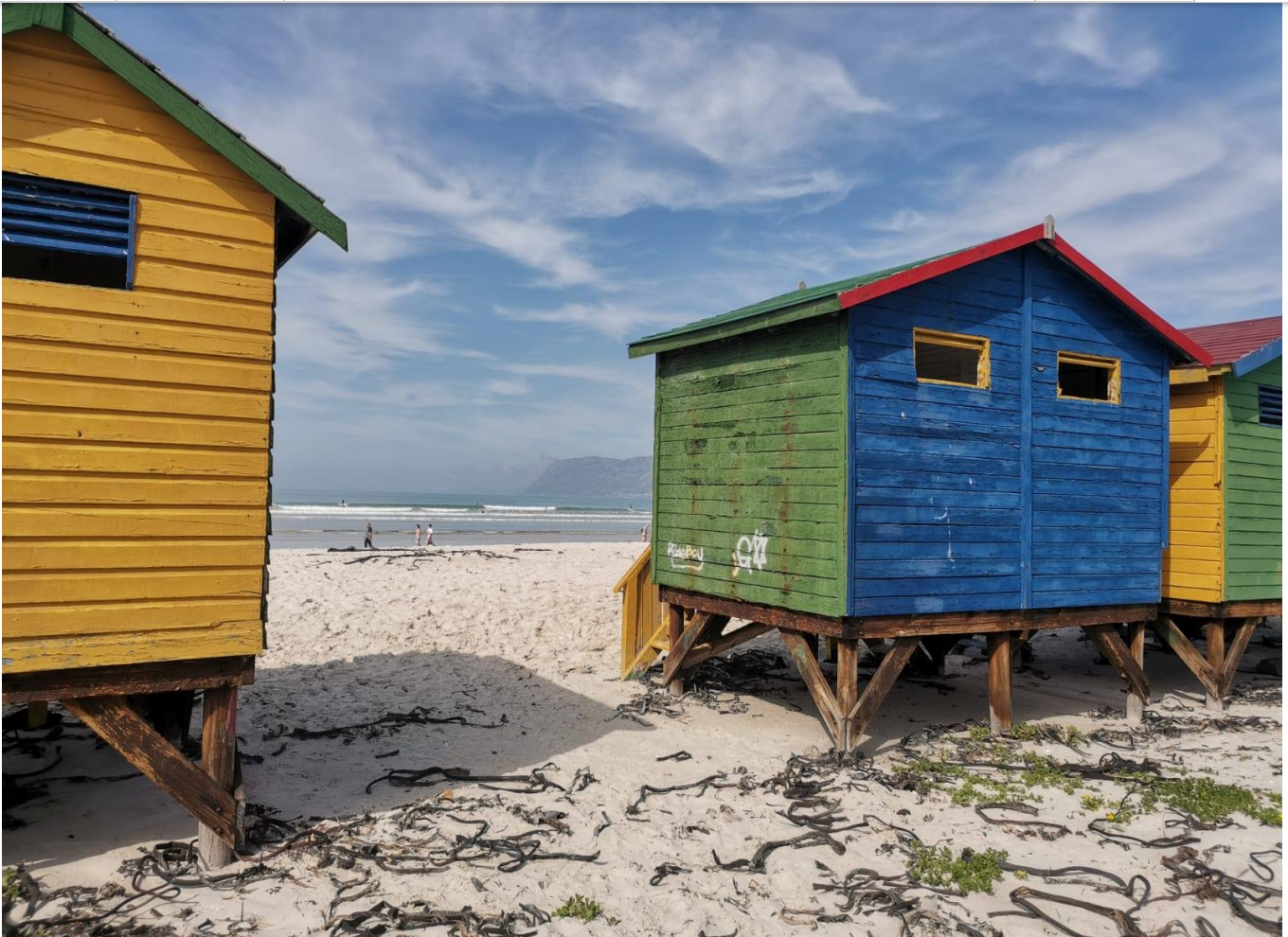
The iconic beach huts are in dire need of some TLC.

Another great way to support the beach hut project – and show your Muizenberg pride – is to purchase a Muizenberg buff. Made out of cotton in colours representing the beach huts, a percentage of sales from these buffs will go towards the Save Our Beach Huts initiative.