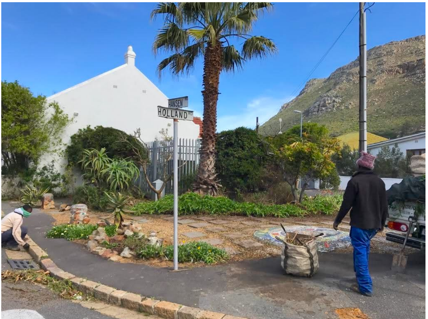
The Palmer Road garden cleaned and cleared.

Last month we tackled the Palmer Road garden as well as the large circle garden at Surfer's Corner for a clean up, which saw overgrowth and weeds removed. Our aim is to keep these gardens looking decently maintained.