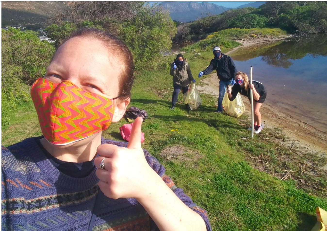
Masked, gloved and ready to clean up!