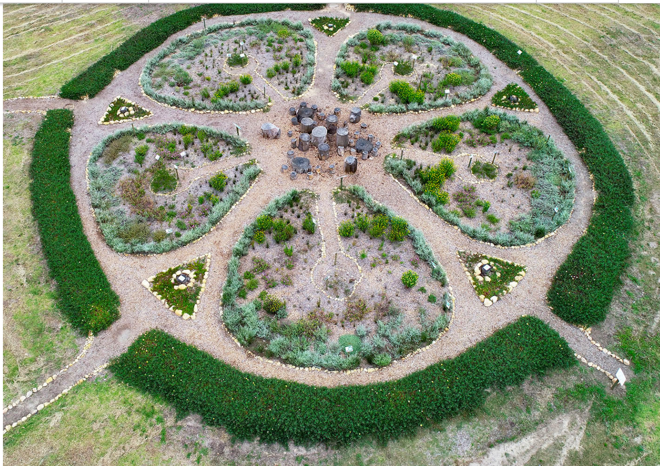
The Zandvlei Strandveld Circle has the same design as FynbosLIFE's Grootboschkloof Fynbos Circle in Constantia.

It will be soon be filled with plants with medicinal, edible, biodiversity and/or horticultural value that are specific to the original veld type of Zandvlei. Along with detailed signage to educate users, the Zandvlei Strandveld Circle's circular design represents the restoration of a healthy fynbos ecosystem.