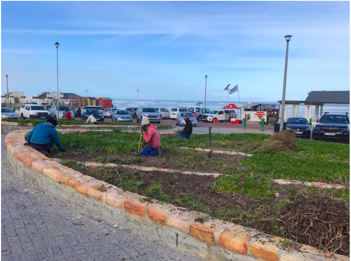
The Surfer's Corner garden after the big clean up.

We will also be cleaning up several of the 'island gardens' in the centre of roads in Muizenberg.