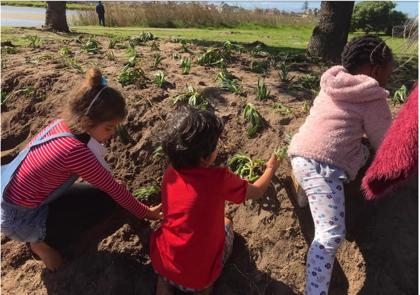
Class 1 planting the windbreaker wall for the vleis new veld circle.

While FybosLIFE will coordinate and undertake hard maintenance of the veld circle, the non-profit organisation is looking for volunteers to assist with light maintenance on an on-going basis.