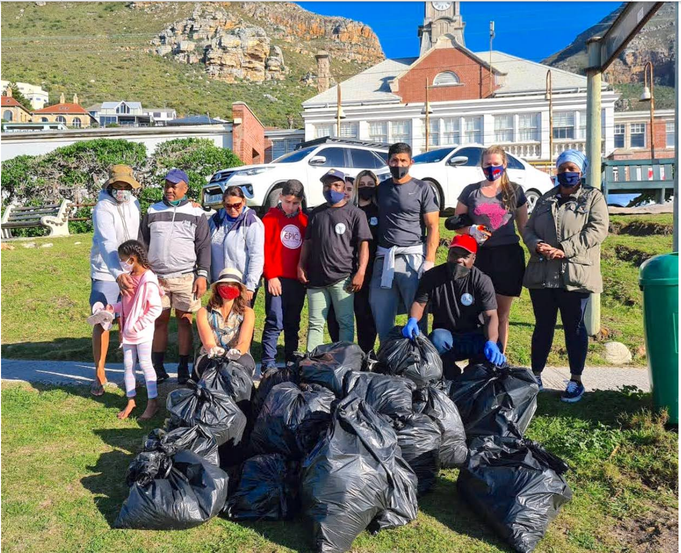
Epic Print staff and volunteers with their trash haul after the last beach clean up.

You can support this initiative by volunteering your time – Epic promises coffee and muffins to all volunteers!