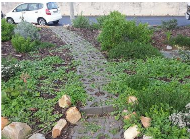
Figure 32: The pathway at the garden on the corner of Royal and Alexander before the weeds were removed.