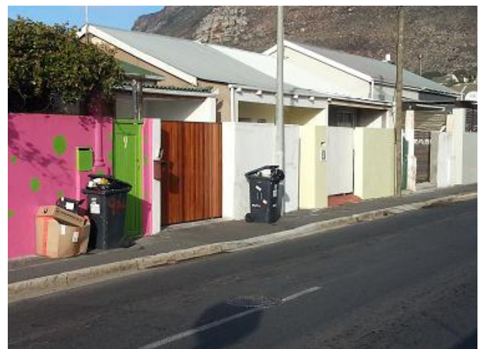
Figure 9: Overloaded bins in Albertyn Road.