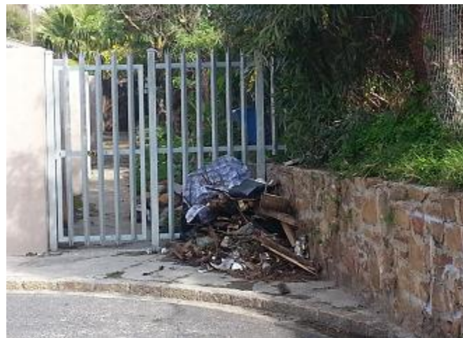
Figure 11: Waste dumped at the bottom of Milner Road.