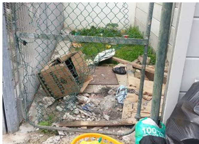
Figure 13: Dumping at the transformer block in Church Road.