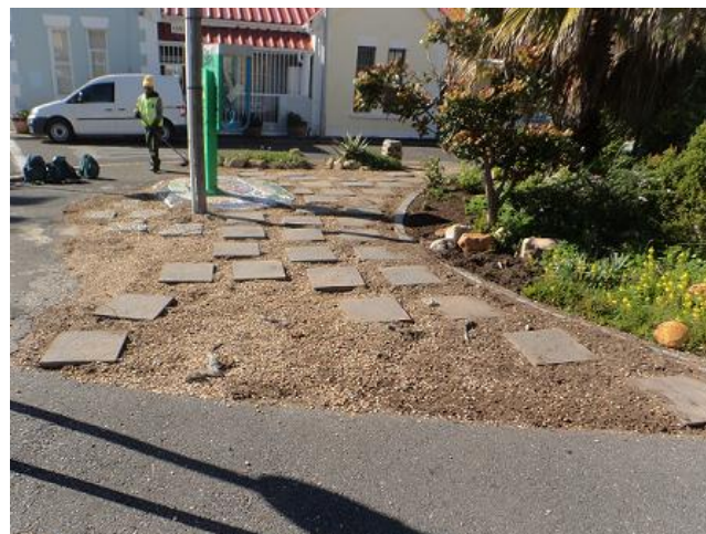
Figure 19: The team performing maintenance duties at the garden on the corner of Holland and Palmer.