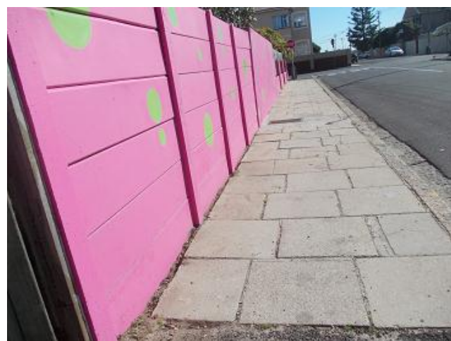
Figure 25: The pavement in Albertyn Road after being weeded.