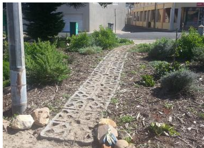
Figure 33: The pathway in the previous image after the removal of weeds.