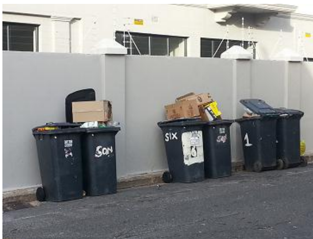
Figure 8: Overloaded bins in Church Road.

See images below for more details on some of the events that transpired within Priority Area Three during August 2015.