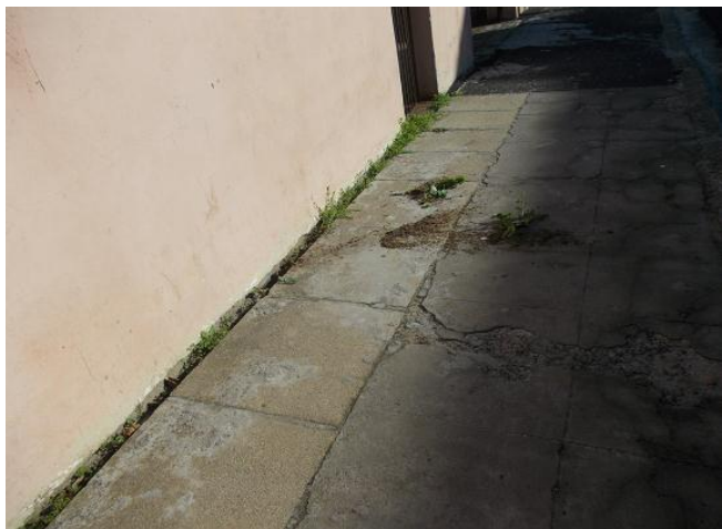
Figure 22: A pavement in Albertyn Road before being weeded.