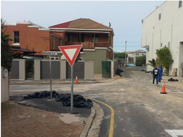
Figure 6: Sand deposited in Rhodesia Road due to flooding caused by burst pipe.