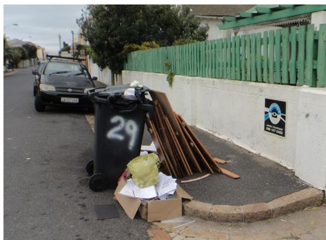
Figure 20: Dumping in Clevedon Road.