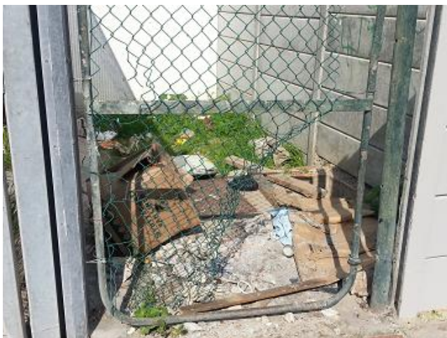
Figure 18: Another incident of dumping at the Church Road transformer block.