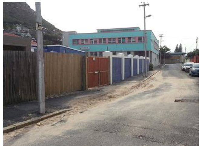
Figure 5: Another image of sand deposited in Rhodesia Road due to flooding caused by burst pipe.