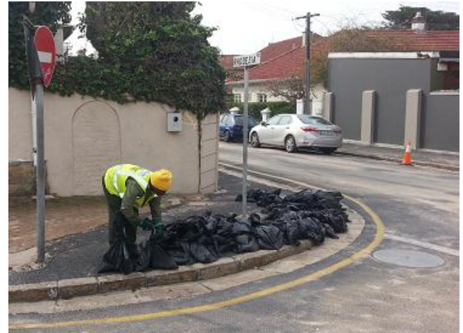
Figure 7: An MID cleaning team member filling bags with sand in Rhodesia Road.