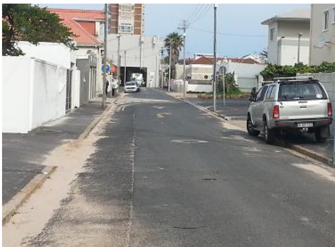
Figure 4: Sand deposited in Rhodesia Road due to flooding caused by burst pipe.