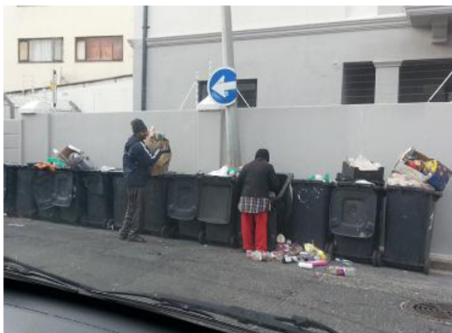
Figure 12: Vagrants Scratching through bins in Church Road.