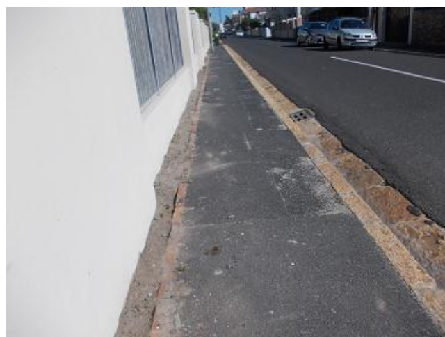
Figure 27: The pavement in Alexander Road after being weeded.