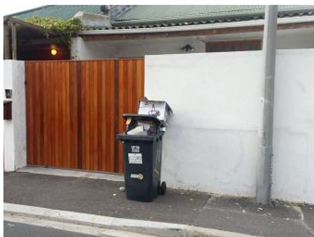
Figure 14: An overloaded bin in Albertyn Road.