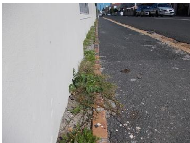
Figure 26: A pavement in Alexander Road before being weeded.