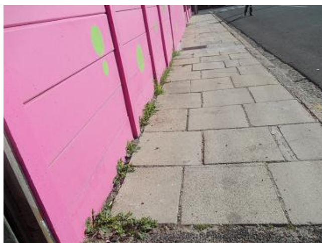
Figure 24: Another pavement in Albertyn Road before being weeded.