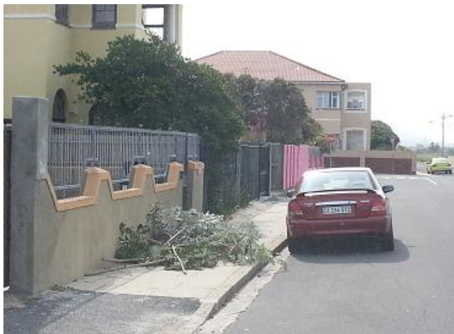
Figure 10: Green waste dumped in Clevedon Road.