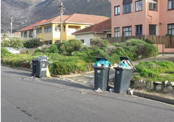
Figure 28: Overloaded bins in Royal Road.

There are no serious incidents to report on in Priority Area Four for August 2015. See images below for more details on some of the events that transpired within Priority Area Four during July 2015.