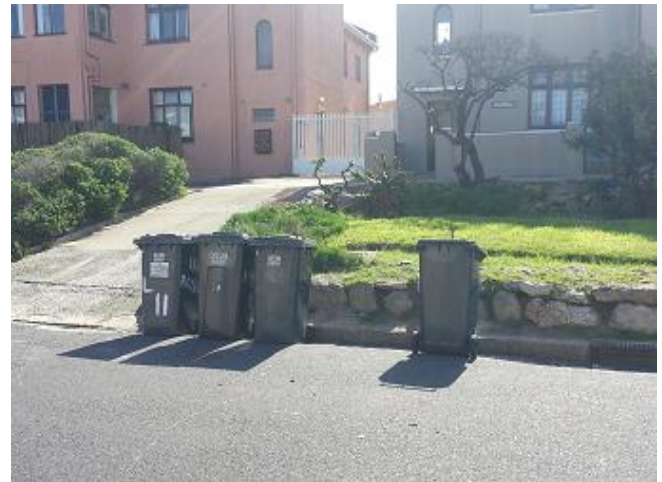
Figure 31: The area in the previous images after it had been cleaned.