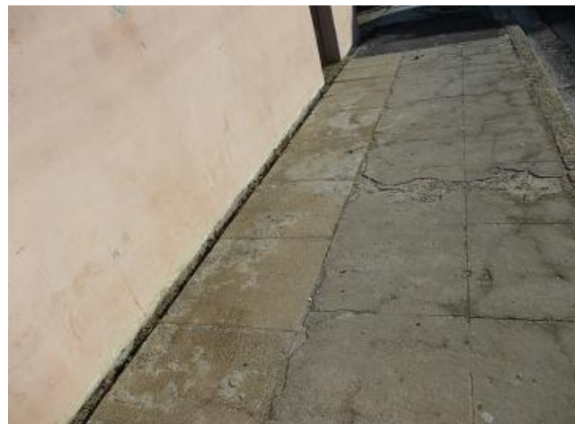
Figure 23: The pavement in Albertyn Road after being weeded.