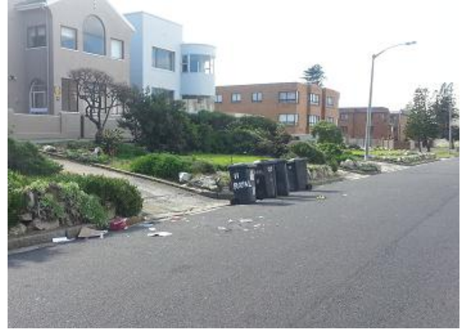
Figure 29: The area in the previous image after the waste was collected by the CoCT.