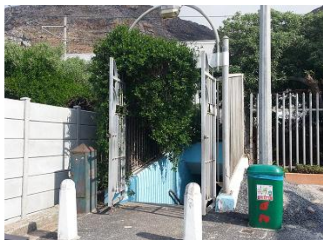
Figure 15: The Church Road subway before the vegetation was trimmed.