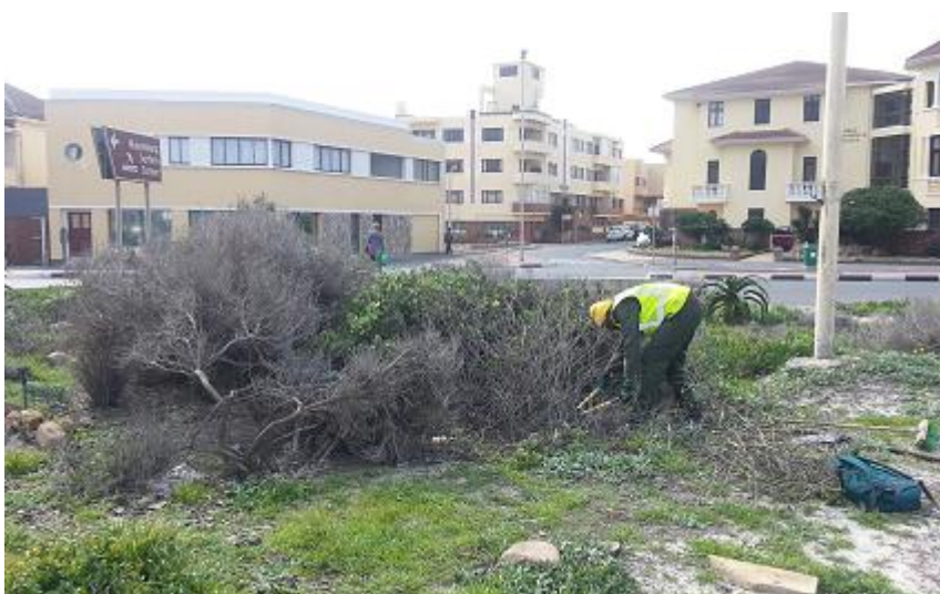
Figure 3: An MID Cleansing Team member performing maintenance procedures at the garden at the Civic Centre Parking Area