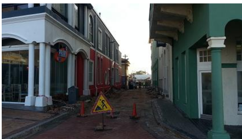
Figure 2: Roadworks in Sidmouth Road.

The team has however serviced the rest of Priority Area One and performed maintenance procedures such as litter clean up, pruning, trimming and weeding at the garden on the border of the Civic Centre Parking area (Figure 3). There are no serious incidents or event to report on in Priority Area One for August 2015.