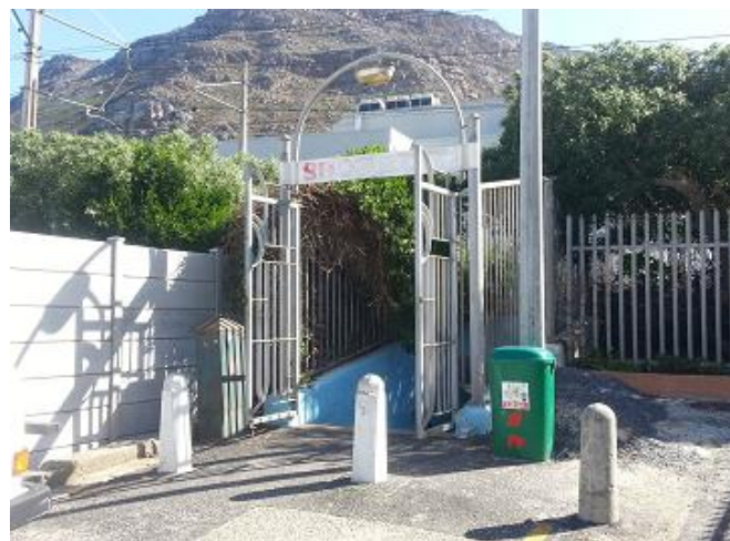
Figure 17: The Church Road subway as it was after having the vegetation trimmed.