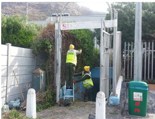
Figure 16: The MID Cleansing team trimming the vegetation at the Church Road subway.