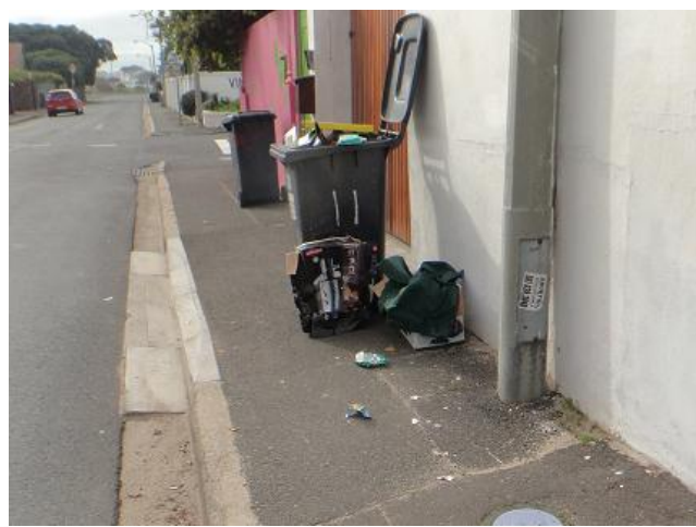
Figure 21: Dumping in Albertyn Road.