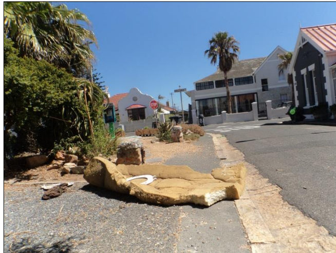
Figure 7: Mattress located on the corner of Holland and Hansen Road.

The garden area on the corner of Holland and Palmer Road has been identified as an area where vagrants have been establishing temporary shelters. As a result, the area is challenging to maintain and requires frequent monitoring.