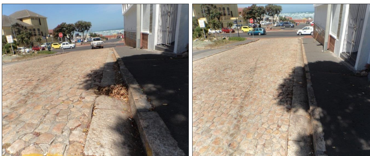
Figure 4: Servicing of guttering system on School Road.