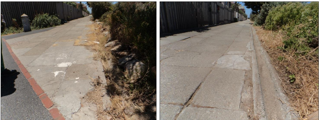
Figure 8: Weeding and pruning on Royal Road.

Work has continued without any major issues in priority area four. Ongoing weeding and gardening has been taking place throughout the area.