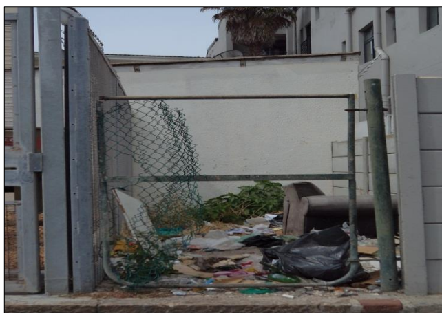
Figure 5: Dumping area next to electricity transformer on Church Road.

Church Road is one of the most challenging areas within the MID to maintain and keep free from litter. The area adjacent to the electricity transformer is a hotspot for dumping. Vagrants have also been using the area as a lavatory.