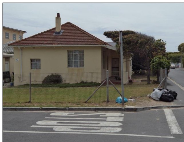
Figure 6: Refuse being left behind by COCT after refuse collection as a result of black bags not being placed in refuse bins.