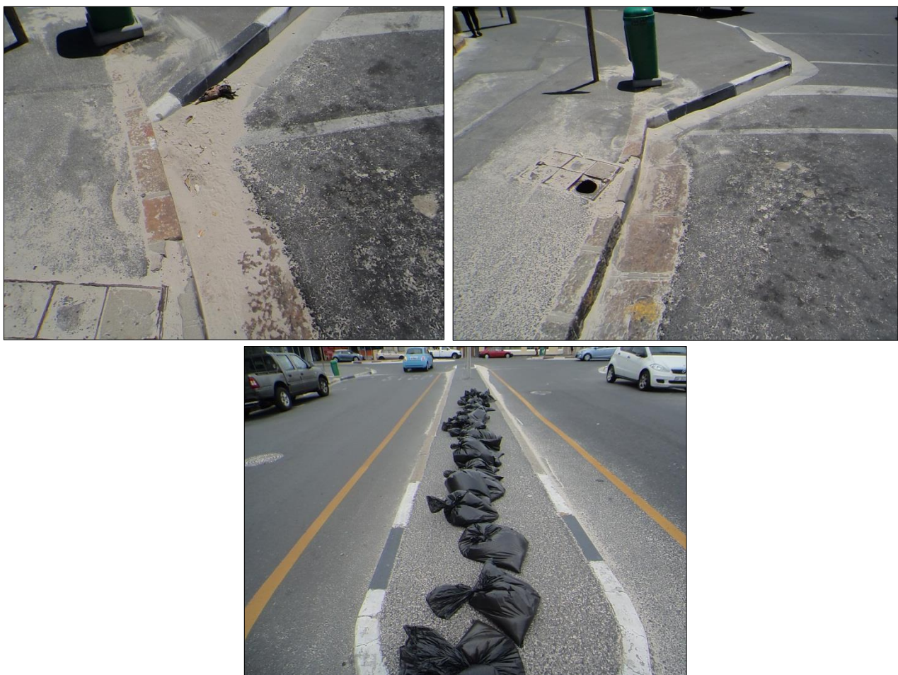
Figure 2: Sand Build-up and maintenance on Beach Road.

This area has experienced a high volume of traffic. This resulted in an increase of litter found in the area. Servicing the guttering system has also proven to be challenging as the parking area is filled before the start of the cleaning teams operational hours. This makes it challenging to service the guttering system in this area. Due to an ever present South Easterly wind blowing through the area, sand build-up is being monitored by the team. The areas of main concern with regards to this are Atlantic Road, Beach Road and Surfers Corner parking area.