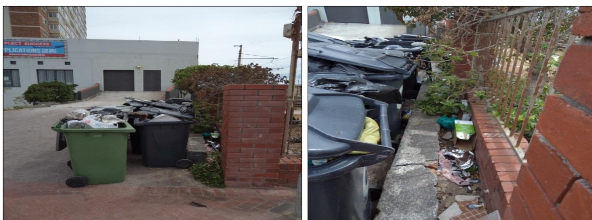
Figure 3: Bins at Cinnabar apartment complex, excess waste being deposited in surrounding areas.

Ongoing mechanical weeding is being conducted within the area. This is focussed on reducing the seed load and hence regrowth of weeds.