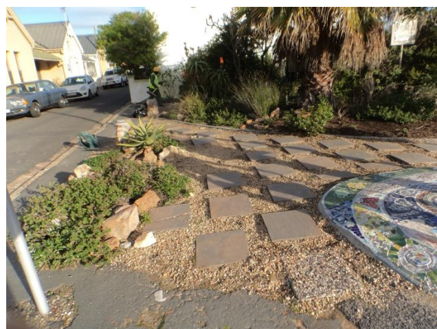
Figure 5: Cleaning of the garden by Palmer Road after.