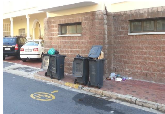
Figure 10: Overloaded bins and waste dumped in Alexander Road.