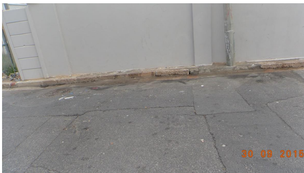
Figure 8. After litter dumping on Church road was removed by the MID cleansing team.