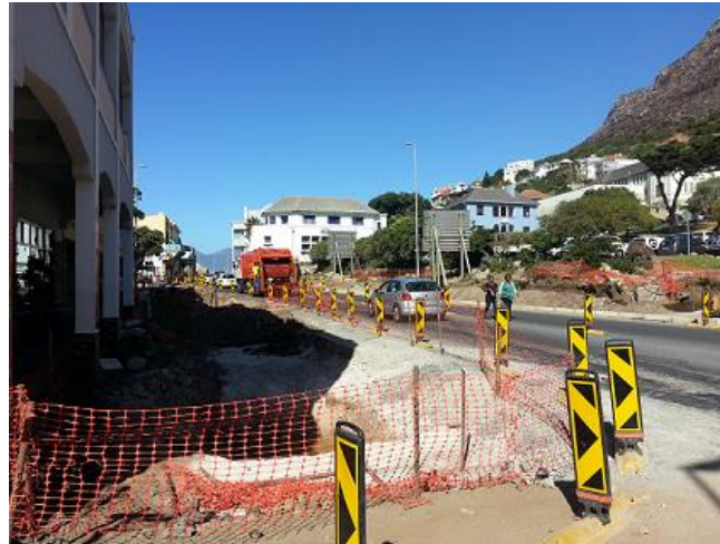
Figure 6: Roadworks in Main Road.