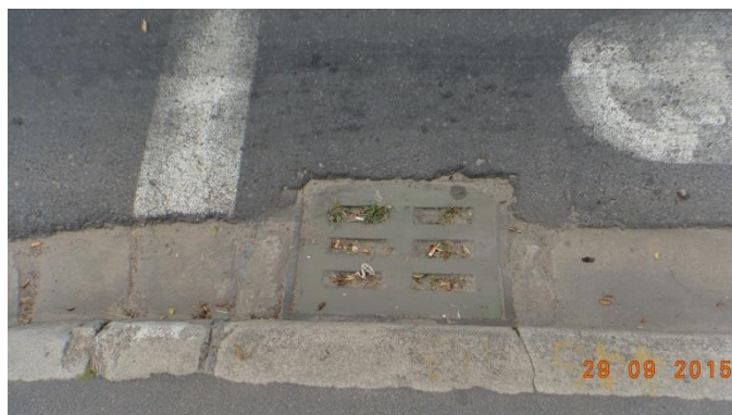
Figure 3 and 4: Due to the flooding that occurred in August 2015, most drains in Rhodesia road is blocked and filled with sand and to be addressed.