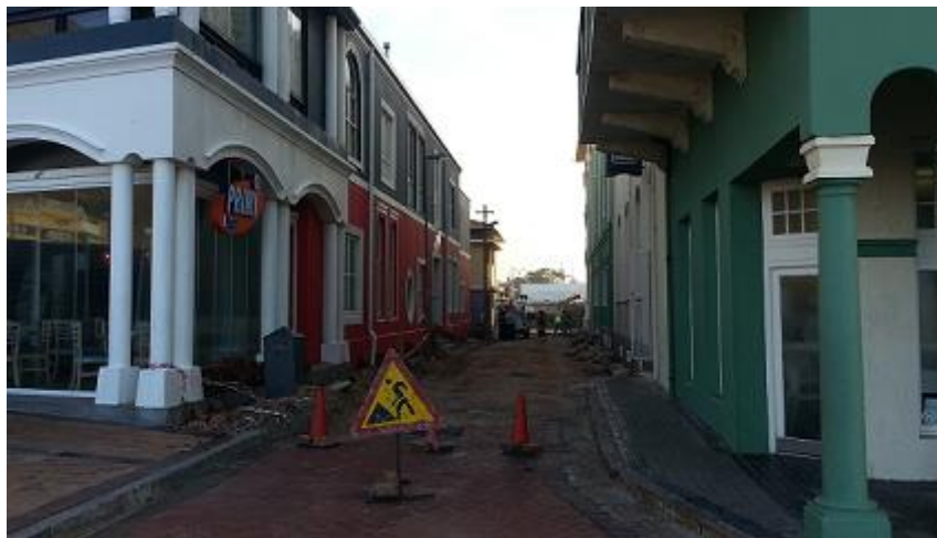
Figure 2: Roadworks in Sidmouth Road.

There are no serious incidents or event to report on in Priority Area One for September 2015.