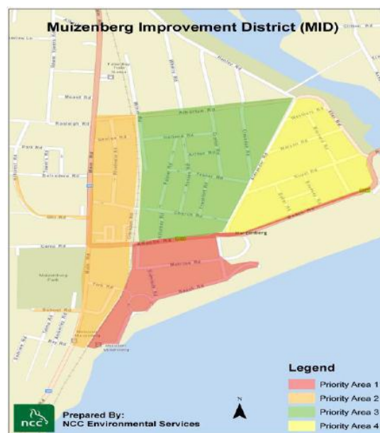
Figure 1: The four Operational Areas of the MID.