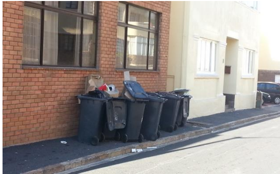
Figure 9: Overloaded bins in Alexander Road.

During September 2015 Priority Area Four experienced some minor incidents of dumping. See images below for more details on some of the events that transpired within Priority Area Four during September 2015.